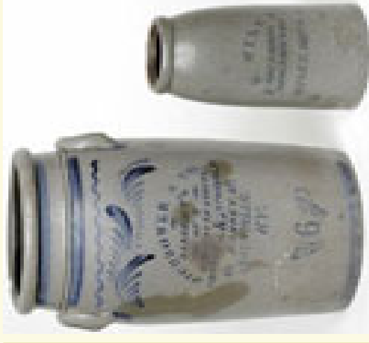
Pictured above: Stoneware produced by Bierbower & Co. Stoves and Tinware.